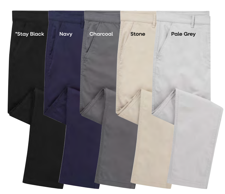
*Stay Black improved colour fastness for up to 20 washes

Fabric: 98% Cotton, 2% Elastane. Weight: 240gsm