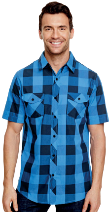
BU9203 Buffalo Plaid Woven Shirt 55% Cotton / 45% Polyester S, M, L, XL, XXL, 3XL 96 gsm