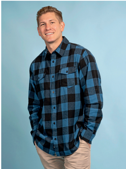
BU8210 Woven Plaid Flannel Shirt 80% Cotton / 20% Polyester S, M, L, XL, XXL, 3XL 180 gsm