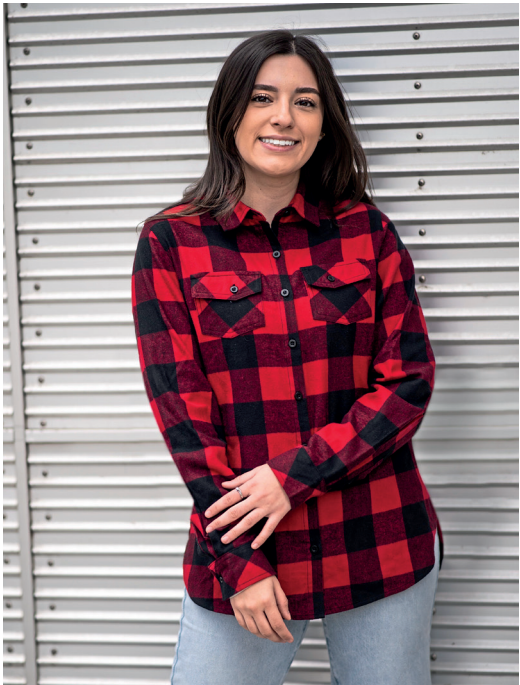
BU5210 Ladies' Woven Plaid Flannel Shirt 80% Cotton / 20% Polyester S, M, L, XL, XXL, 3XL 180 gsm