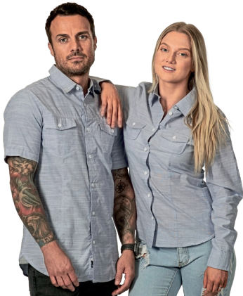
BU9247 Woven Texture Shirt 55% Cotton / 45% Polyester S, M, L, XL, XXL, 3XL 112 gsm