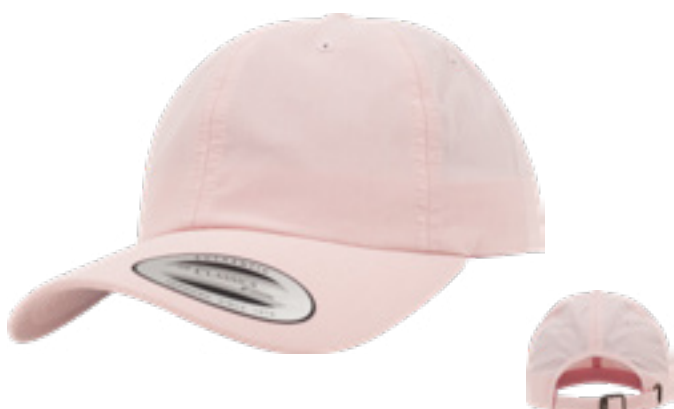
Antique Brass Buckle

The Low Profile Washed Cap from FLEXFIT with curved visor in an used-looking color is a trendsetter. For a perfect fit, the cap is individually adjustable with an antique brass buckle closure. The grommet ventilation and the interior sweatband ensure a pleasant wearing in any weather condition.