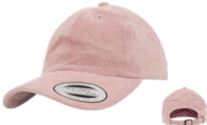
Antique Brass Buckle

Are you looking for an outstanding cap? Then the Low Profile Velours Cap from FLEXFIT is the right one for you. The suede appearance gives a touch of class to every outfit. Available in trendy colors and with a curved visor, this cap is a trendsetter. Adjust the size individually with the antique brass buckle closure. The grommet ventilation and the interior sweatband ensure a pleasant wearing in any weather condition.