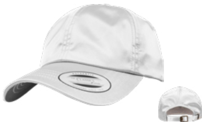
Antique Brass Buckle

Due to its beautiful satin fabric, the Low Profile Satin Cap is a real eye-catcher. Its classic shape, including a soft front, pre-curved visor and easy strap closure is only beaten by its perfect wearing comfort. Don't be shy and let this stylish and shiny accessory become your new favorite cap!