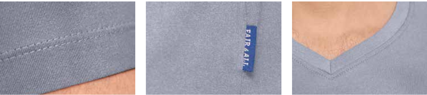
MEN'S STYLE 102