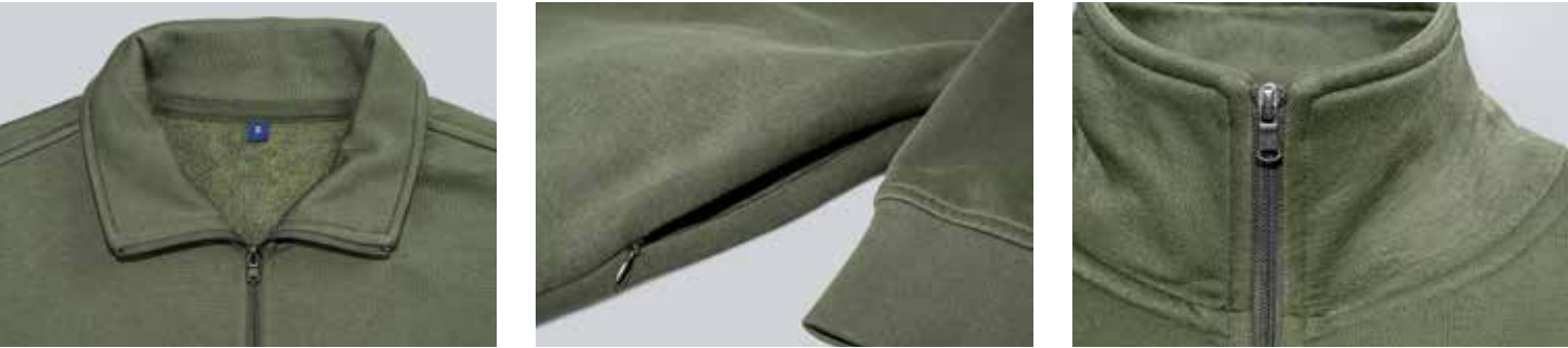
UNISEX STYLE 904