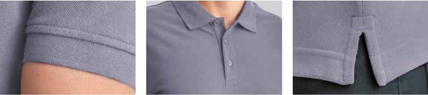
MEN'S STYLE 301