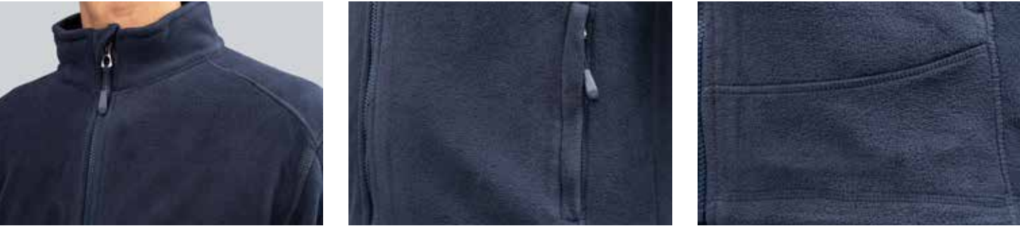
MEN'S STYLE 1201