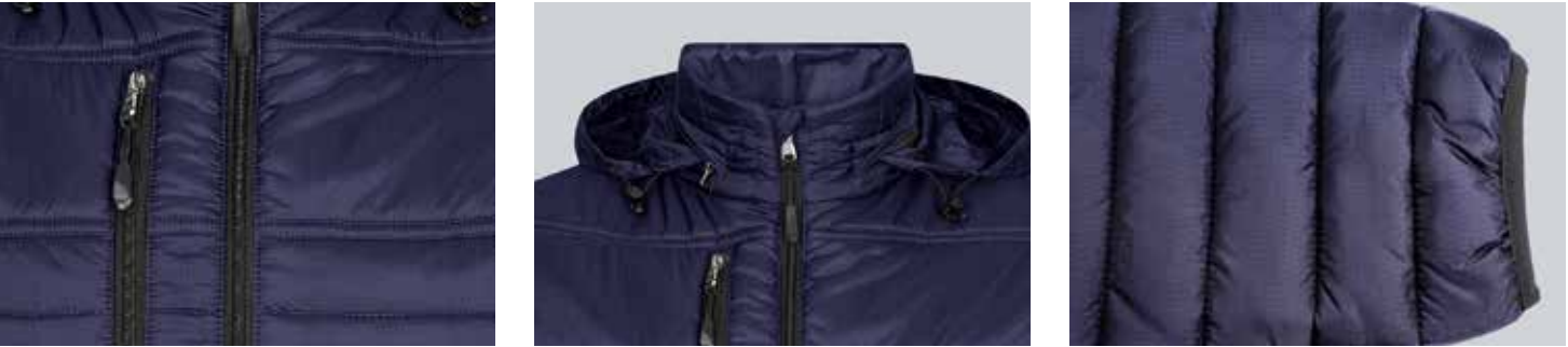
WOMEN'S STYLE 1402