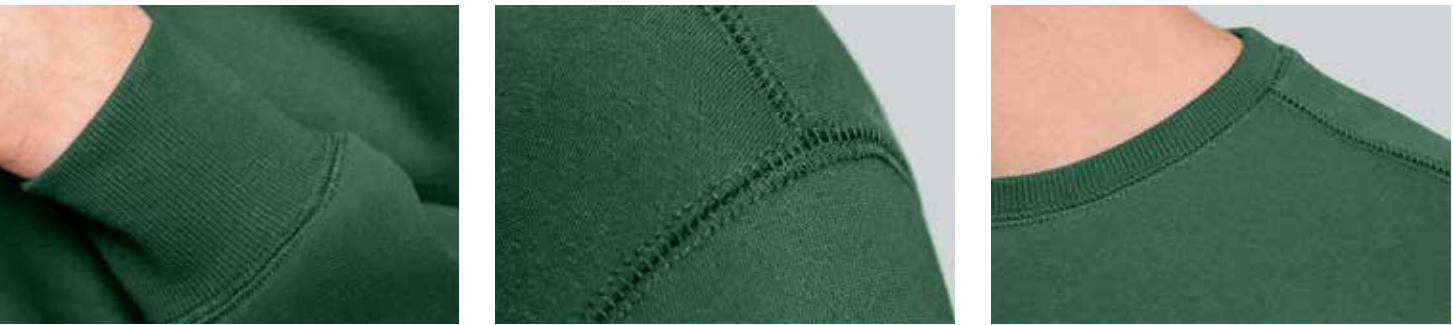
UNISEX STYLE 902