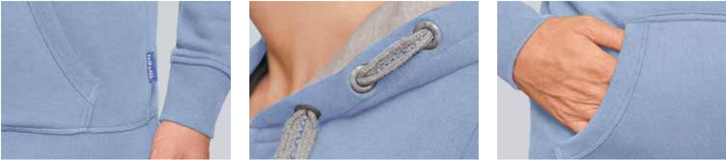
MEN'S STYLE 701