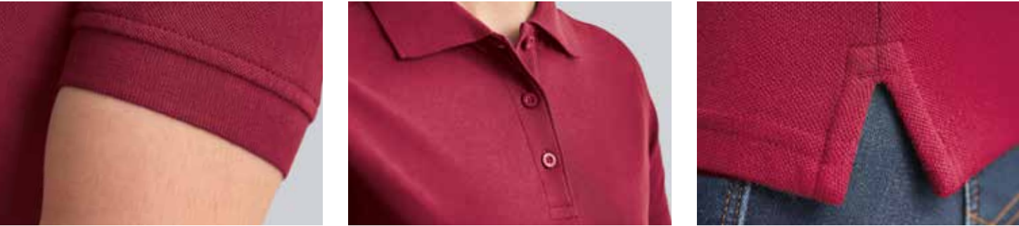
WOMEN'S STYLE 403