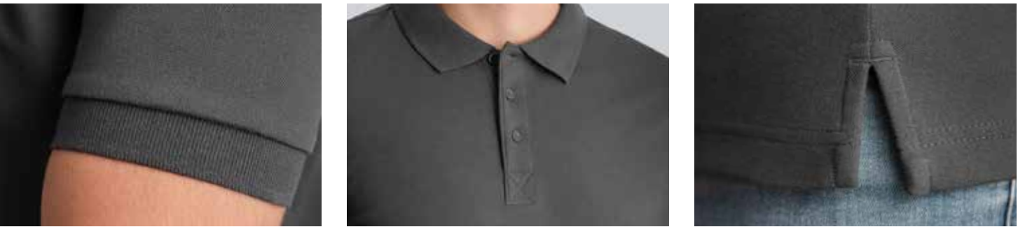
MEN'S STYLE 302