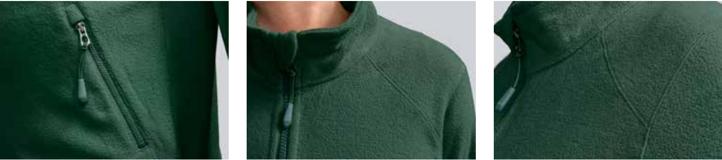
WOMEN'S STYLE 1202