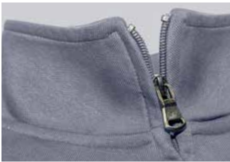
WOMEN'S STYLE 1002