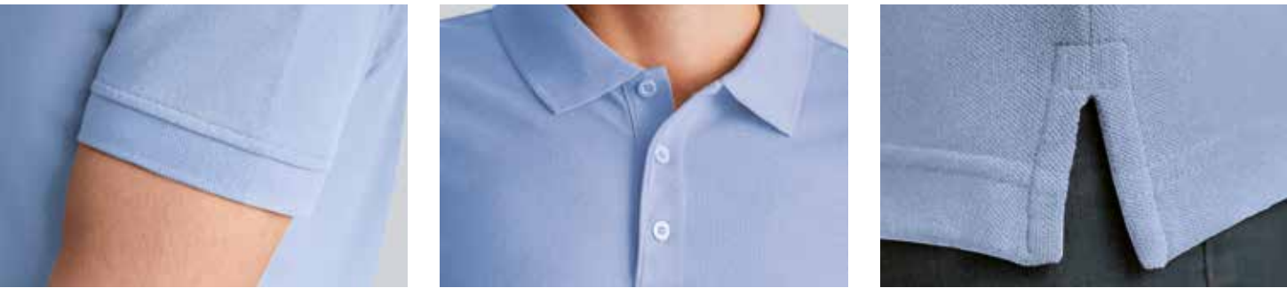
WOMEN'S STYLE 401