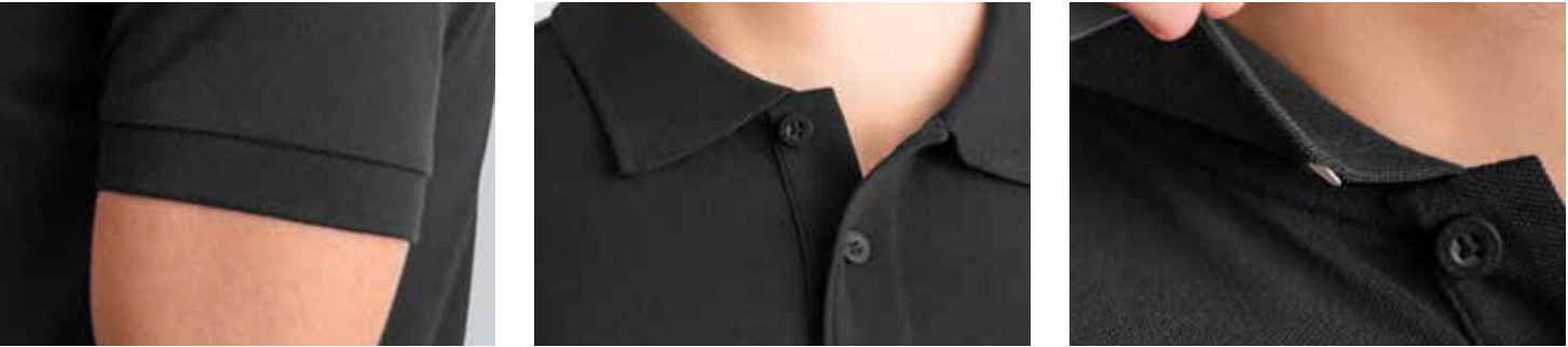
MEN'S STYLE 501