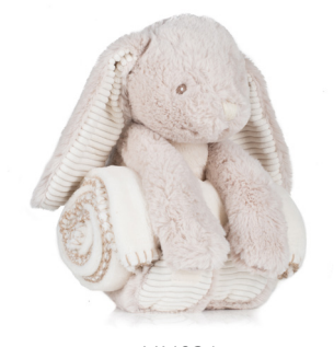
MM034 22cm | 0+ BLANKET: 90 X 75cm