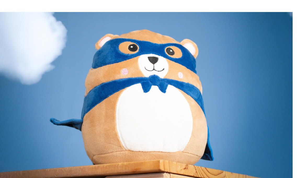
HERO BEAR 23cm|0+