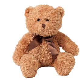
MM003 S 16cm | M 23cm 0+