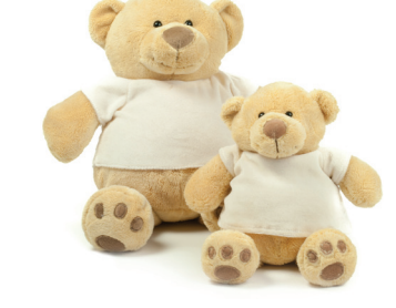
MM021 (T-SHIRT INCLUDED) M 19cm | L 24cm 0 +