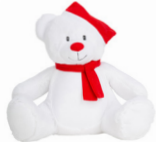
MM573 Zippie Page 10