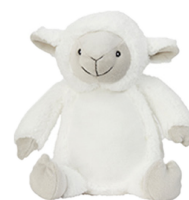
LAMB 19cm | 0+