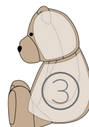
2 PAD SEPARATE BODY AND HEAD STUFFING