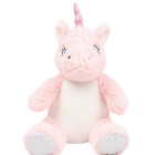
MM060 Print Me Page 6