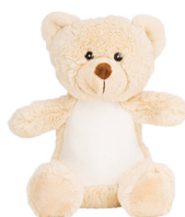
TEDDY 20cm | 0+