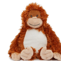
ORANGUTAN 21cm | 0+