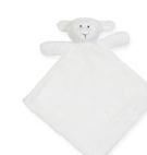
MM019 | Page 14