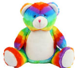
MM555 Zippie Page 9