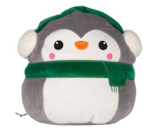
MM800 | Page 5/10