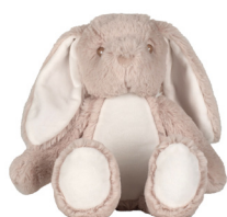
BROWN BUNNY 20cm | 0+