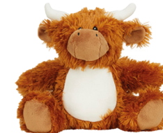
HIGHLAND COW 23cm | 0+