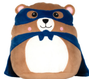
HERO BEAR 23cm|0+