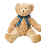
MM001 | Page 12