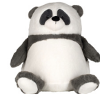
MM582 Zippie Page 8