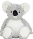
MM574 Zippie Page 8