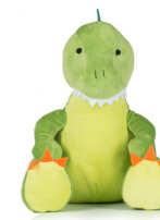
MM053 33cm | 0+