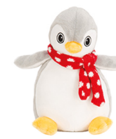
MM060 PENGUIN 22cm | 0+