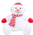
MM567 Zippie Page 10