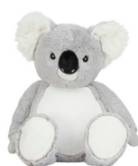
MM574 33cm | 0+