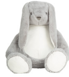
MM550 Giant Zippie Page 9