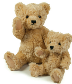
MM016 S 13cm | M 22cm 0+