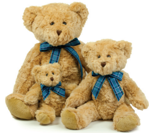
MM001 S 13cm | M 22cm | L 32cm 0+