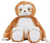
MM572 Zippie Page 9