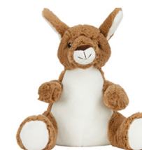
KANGAROO 21cm | 0+