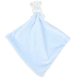
MM700 | Page 14