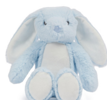
BLUE BUNNY 20cm | 0+