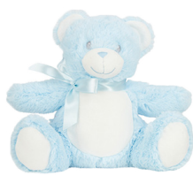
BLUE TEDDY 24cm | 0+