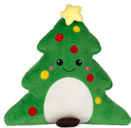
NEW | MM800 CHRISTMAS TREE 36cm | 0+