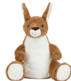
MM575 Zippie Page 9