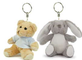
MM023 (TEDDY T-SHIRT INCLUDED) TEDDY | 10cm | +36 months BUNNY | 10cm | +36 months