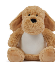
DOG 20cm | 0+