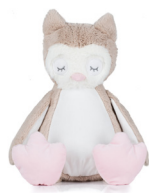
MM054 30cm | 0+