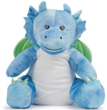
MM579 Zippie Page 8