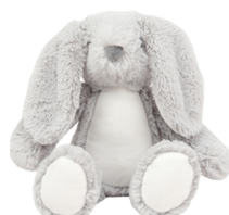
GREY BUNNY 20cm | 0+