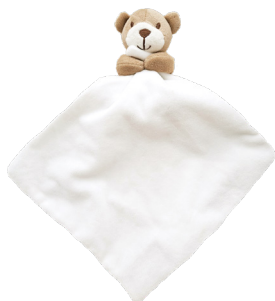
MM020 30 x 30cm | 0+