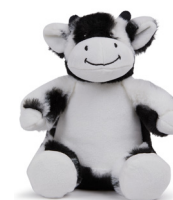
COW 21cm | 0+