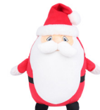
MM563 Zippie Page 10