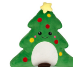
MM800 | Page 5/10