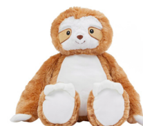
MM572 31cm | 0+