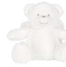
MM060 Print Me Page 6