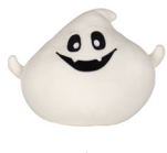
MM801 | Page 4