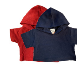
MM088 | Page 13