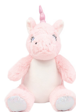
UNICORN 20cm | 0+