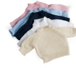
MM083 | Page 13