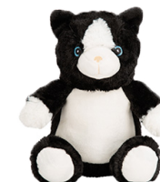
CAT 21cm | 0+