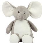
MM558 Zippie Page 9