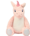
MM570 Zippie Page 9