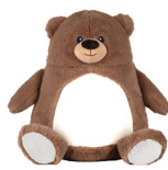
MM581 Zippie Page 8