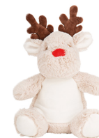
MM060 REINDEER 21cm | 0+