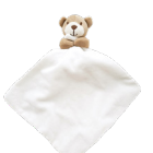
MM020 | Page 14