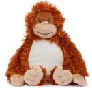
MM060 Print Me Page 7