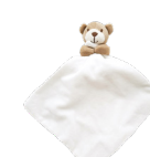
MM020 | Page 14