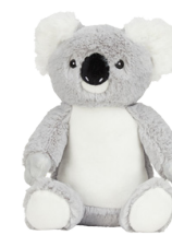
KOALA 24cm | 0+