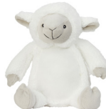
MM576 Zippie Page 9