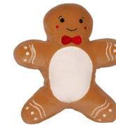
NEW | MM801 GINGERBREAD MAN 25cm | 0+