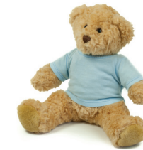
MM071 TEDDY T-SHIRT +36 months