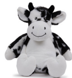
MM578 Zippie Page 9