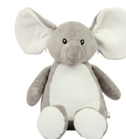
MM558 32cm | 0+