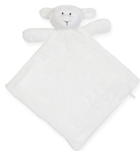
MM019 35 x 32cm | 0+