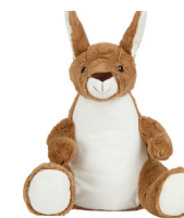
MM575 32cm | 0+