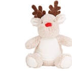
MM060 Print Me Page 11