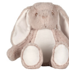
MM060 Print Me Page 6