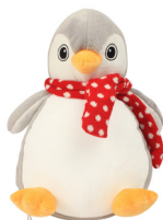
MM566 PENGUIN 32cm | 0+