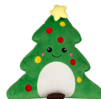
CHRISTMAS TREE 36cm|0+