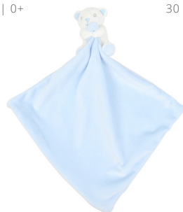
MM700 26 x 26cm | 0+