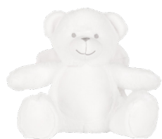
ANGEL BEAR 20cm | 0+