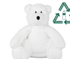
MM061 ECO POLAR BEAR 22cm | 0+