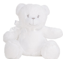
WHITE TEDDY 23cm | 0+