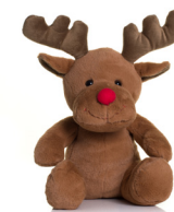
MM033 21cm | 0+