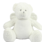
MM561 Zippie Page 9