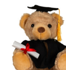
MM036 | Page 12