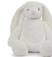
MM050 32cm | 0+