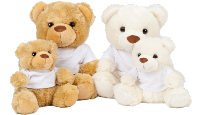
MM030 (T-SHIRT INCLUDED) S 16cm | M 23cm 0+