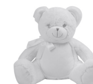
MM556 40cm | 0+