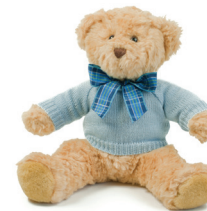
MM083 TEDDY JUMPER +36 months