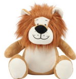
MM569 Zippie Page 8