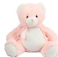
MM556 40cm | 0+