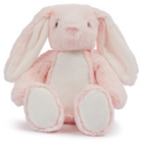
MM060 Print Me Page 6