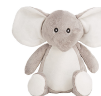
ELEPHANT 20cm | 0+