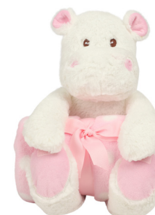
MM606 30cm | 0+ BLANKET: 90 X 75cm