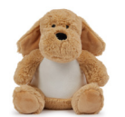
MM060 Print Me Page 7