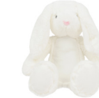
MM060 Print Me Page 6