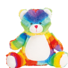
MM060 Print Me Page 7