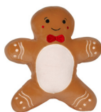
GINGERBREAD MAN 25cm|0+