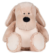
MM052 32cm | 0+