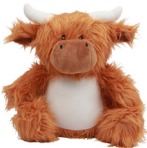
MM565 Zippie Page 8