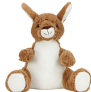
MM060 Print Me Page 7