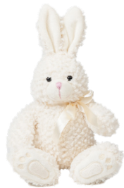
MM018 M 26cm 0+