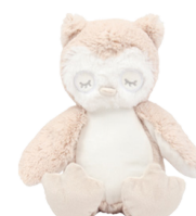
OWL 22cm | 0+