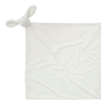
MM751 | Page 14