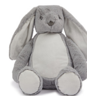
MM050 32cm | 0+