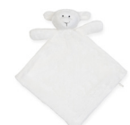
MM019 | Page 14