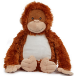
MM580 Zippie Page 8