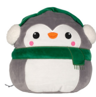
NEW | MM800 PENGUIN 31cm | 0+