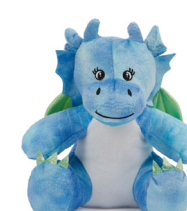
DRAGON 22cm | 0+