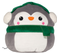
NEW | MM800 PENGUIN 31cm | 0+