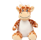
MM060 Print Me Page 7