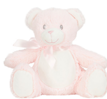
PINK TEDDY 24cm | 0+