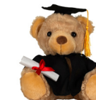
MM036 | Page 12