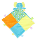
MM701 | Page 14