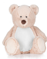
MM051 32cm | 0+