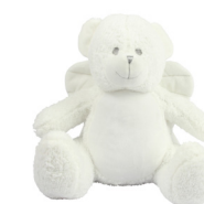
MM561 42cm | 0+