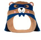
MM801 | Page 4