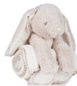
MM034 22cm | 0+ BLANKET: 90 X 75cm