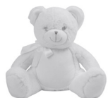
MM556 Zippie Page 9