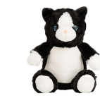
MM060 Print Me Page 7