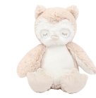
MM060 Print Me Page 7