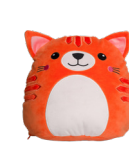
MM800 | Page 5