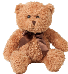
MM003 S 16cm | M 23cm 0+