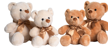
MM032 S 20cm | M 30cm 0+