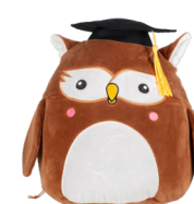
WISE OWL 29cm|0+