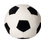
MM583 Zippie Page 8