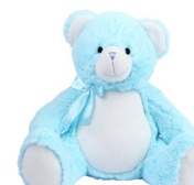
MM556 40cm | 0+