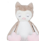
MM054 Zippie Page 8