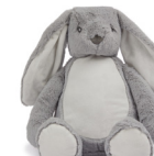
MM050 Zippie Page 9