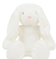
WHITE BUNNY 20cm | 0+