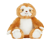
MM060 Print Me Page 7