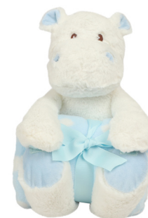
MM606 30cm | 0+ BLANKET: 90 X 75cm