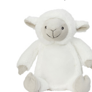
MM576 35cm | 0+