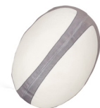
MM584 23cm | 0+ 95% POLYESTER 5%ELASTANE