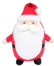
MM563 FATHER CHRISTMAS 33cm | 0+