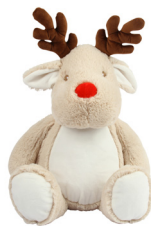
MM560 REINDEER 32cm | 0+