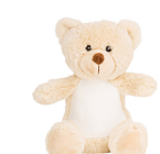
MM060 Print Me Page 6