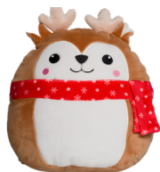
MM800 DEER 29cm | 0+