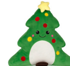
MM800 | Page 5/10