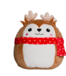
MM800 | Page 5/10