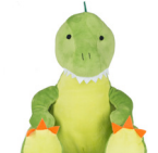
MM053 Zippie Page 9