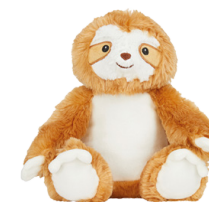
SLOTH 24cm | 0+