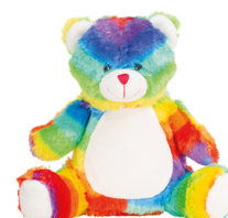
RAINBOW BEAR 20cm | 0+