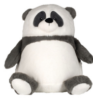
MM582 34cm | 0+