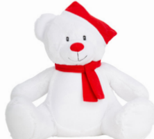
MM573 CHRISTMAS BEAR 35cm | 0+