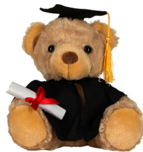
MM036 L 23cm 36+ months