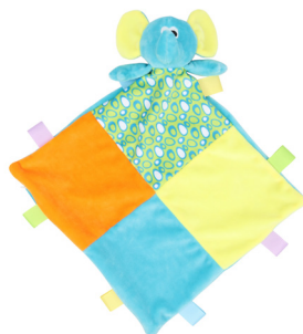
MM701 31 x 31cm | 0+