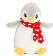
MM060 PENGUIN 22cm | 0+