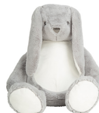
MM550 50cm | 0+