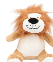
LION 20cm | 0+