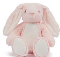
PINK BUNNY 20cm | 0+