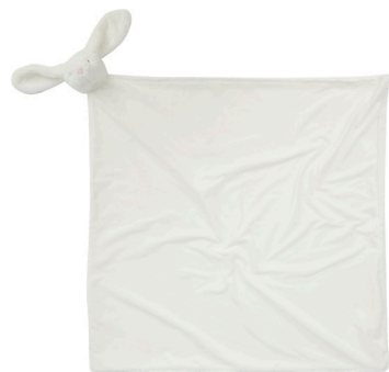
MM751 75 X 75cm | 0+