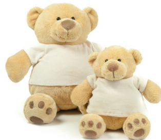
MM021 (T-SHIRT INCLUDED) M 19cm | L 24cm 0+