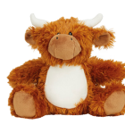
MM060 Print Me Page 7