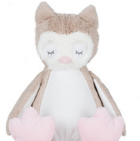
MM054 Zippie Page 8