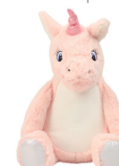
MM570 34cm | 0+