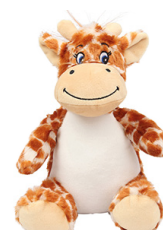
GIRAFFE 20cm | 0+