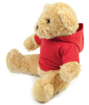
MM088 TEDDY HOODIE +36 months