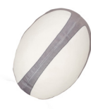
MM584 Zippie Page 8