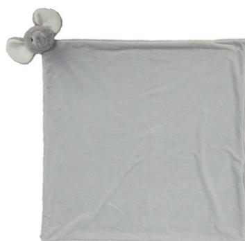
MM751 75 X 75cm | 0+