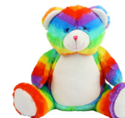
MM555 30cm | 0+