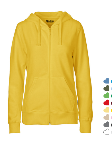
O83301 LADIES ZIP HOODIE 100% ORGANIC FAIRTRADE COTTON 300 GSM