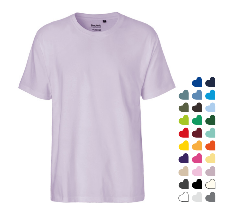
O60001 MENS CLASSIC T-SHIRT 100% ORGANIC FAIRTRADE COTTON 185 GSM

26 different styles • Clean and ready to wear • No pesticides