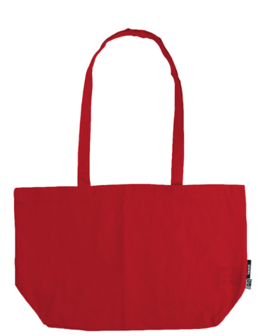
O90015 SHOPPING BAG W. GUSSET 100% ORGANIC FAIRTRADE COTTON 120 GSM