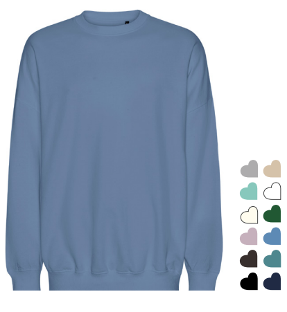
TIGER COTTON OVERSIZED SWEATSHIRT 100% ORGANIC COTTON IN CONVERSION 300 GSM