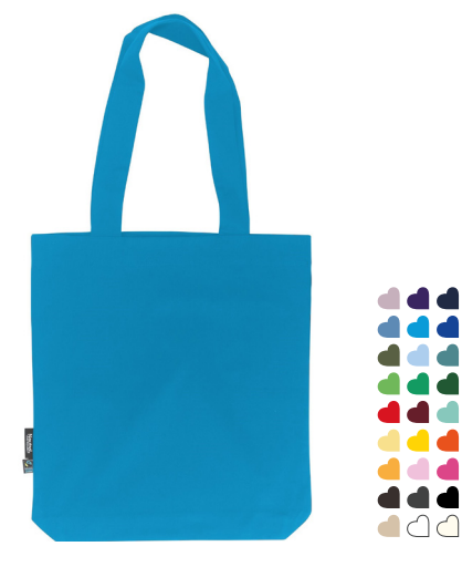
O90003 TWILL BAG 100% ORGANIC FAIRTRADE COTTON 210 GSM

21 different styles • 100% organic • No GMO seeds