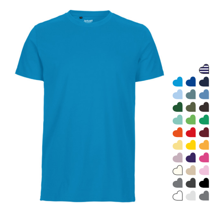
O61001 MENS FIT T-SHIRT 100% ORGANIC FAIRTRADE COTTON 155 GSM