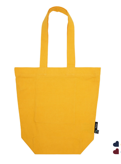
O90053 PANAMA TOTE BAG W. SIP 100% ORGANIC FAIRTRADE COTTON 300 GSM