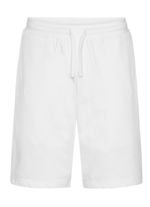
TIGER COTTON SWEATSHORTS 100% ORGANIC COTTON IN CONVERSION 300 GSM