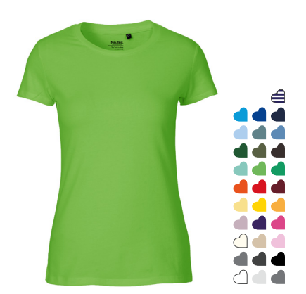
O81001 LADIES FIT T-SHIRT 100% ORGANIC FAIRTRADE COTTON 155 GSM