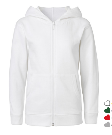
O13301 KIDS HOODIE W. ZIP 100% ORGANIC FAIRTRADE COTTON 300 GSM