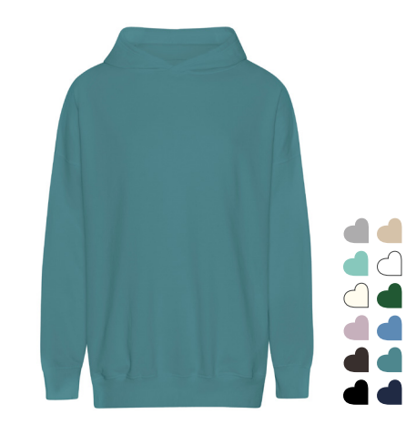
TIGER COTTON OVERSIZED HOODIE 100% ORGANIC COTTON IN CONVERSION 300 GSM