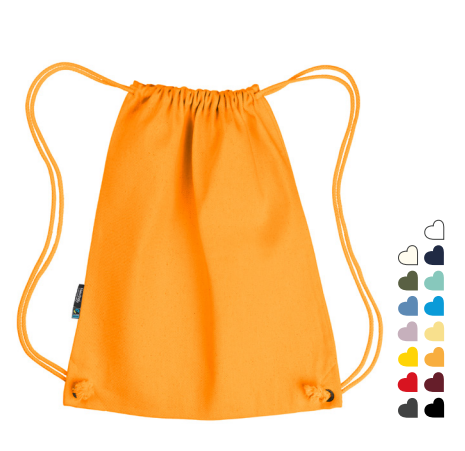
O90020 TWILL GYM BAG 100% ORGANIC FAIRTRADE COTTON 210 GSM