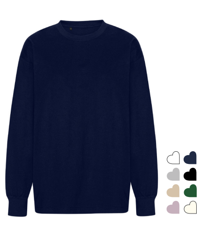
LONG SLEEVE T-SHIRT 100% ORGANIC COTTON IN CONVERSION 220 GSM