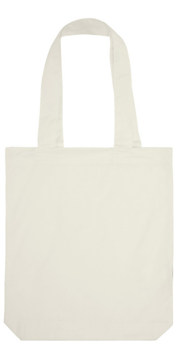
TIGER COTTON TWILL BAG 100% ORGANIC COTTON

16 different styles • Reestablishing biodiversity • Helping farmers