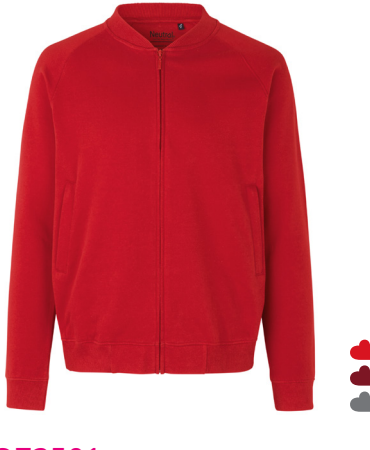
O73501 UNISEX JACKET W. ZIP 100% ORGANIC FAIRTRADE COTTON 300 GSM