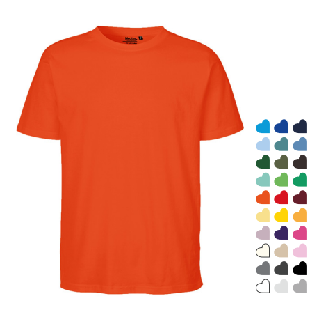
O60002 UNISEX REGULAR T-SHIRT 100% ORGANIC FAIRTRADE COTTON 155 GSM