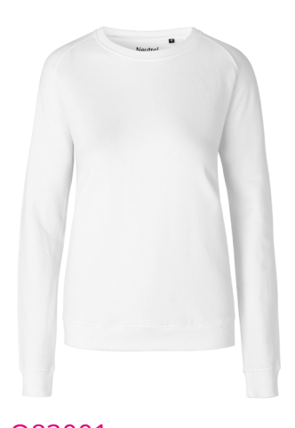
O83001 LADIES SWEATSHIRT 100% ORGANIC FAIRTRADE COTTON 300 GSM