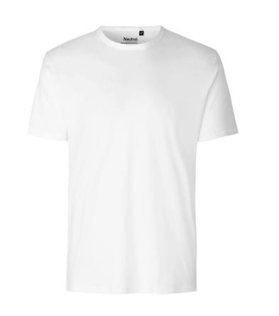
O61030 MENS INTERLOCK T-SHIRT 100% ORGANIC FAIRTRADE COTTON 220 GSM