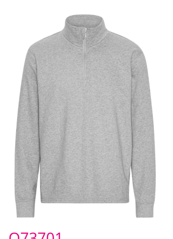
O73701 UNISEX QUARTER ZIP SWEATSHIRT 100% ORGANIC FAIRTRADE COTTON 300 GSM