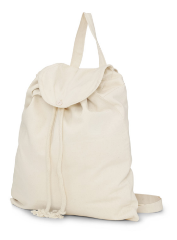
O90070 TWILL LIGHT BACKPACK 100% ORGANIC FAIRTRADE COTTON 210 GSM