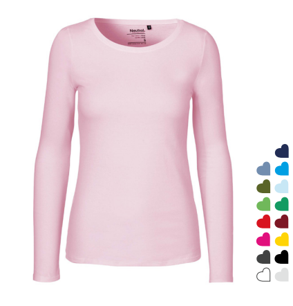
O81050 LADIES LONG SLEEVE T-SHIRT 100% ORGANIC FAIRTRADE COTTON 155 GSM