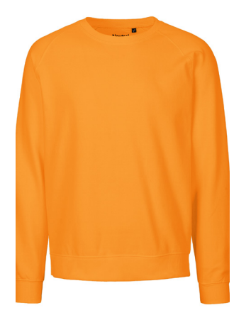
O63001 UNISEX SWEATSHIRT 100% ORGANIC FAIRTRADE COTTON 300 GSM

7 different styles • No toxics • Solar and wind powered