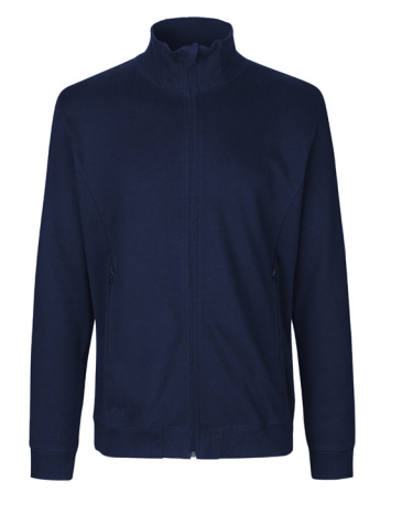
O73601 UNISEX HIGH NECK JACKET 100% ORGANIC FAIRTRADE COTTON 300 GSM