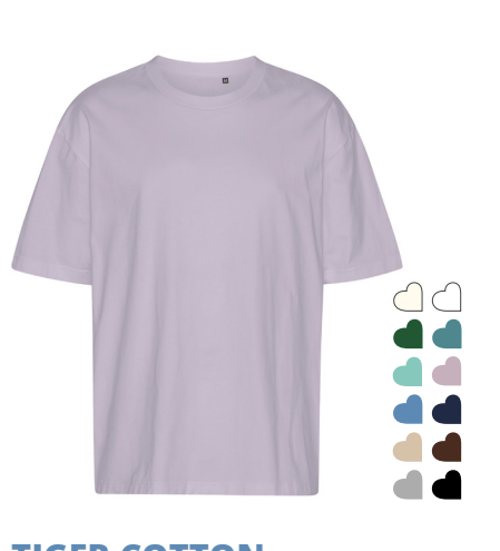
TIGER COTTON OVERSIZED T-SHIRT 100% ORGANIC COTTON IN CONVERSION 220 GSM

100% ORGANIC COTTON IN CONVERSION 210 GSM