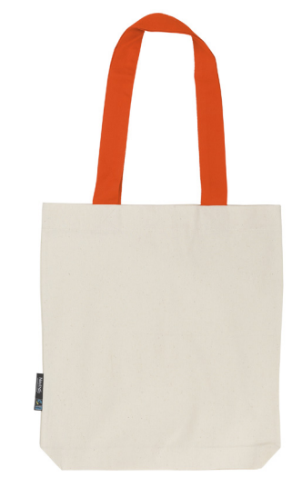
O90002 TWILL BAG W. CONTRAST HANDLES 100% ORGANIC FAIRTRADE COTTON 210 GSM