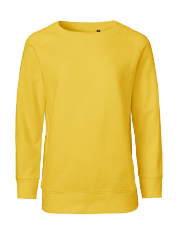
O33001 KIDS SWEATSHIRT 100% ORGANIC FAIRTRADE COTTON 300 GSM