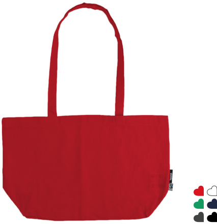
O90015 SHOPPING BAG W. GUSSET 100% ORGANIC FAIRTRADE COTTON 120 GSM