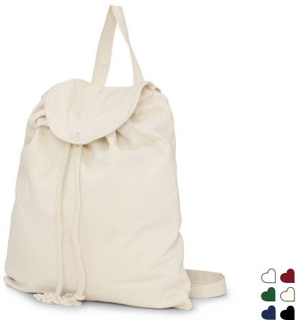
O90070 TWILL LIGHT BACKPACK 100% ORGANIC FAIRTRADE COTTON 210 GSM