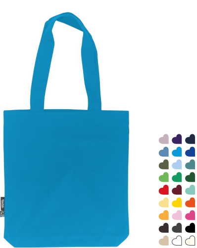
O90003 TWILL BAG 100% ORGANIC FAIRTRADE COTTON 210 GSM

21 different styles • 100% organic • No GMO seeds