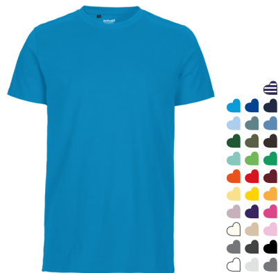
O61001 MENS FIT T-SHIRT 100% ORGANIC FAIRTRADE COTTON 155 GSM