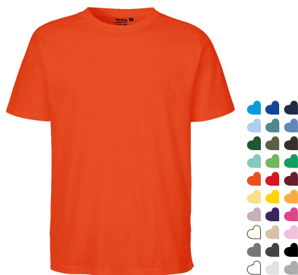
O60002 UNISEX REGULAR T-SHIRT 100% ORGANIC FAIRTRADE COTTON 155 GSM