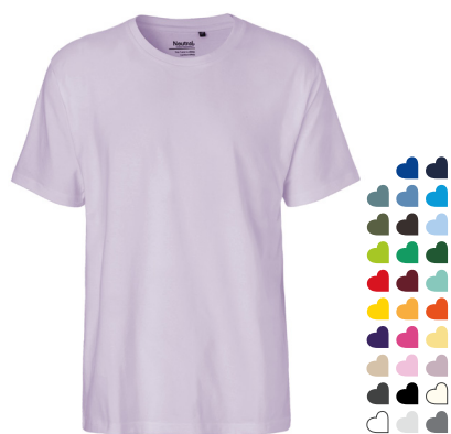
O60001 MENS CLASSIC T-SHIRT 100% ORGANIC FAIRTRADE COTTON 185 GSM

26 different styles • Clean and ready to wear • No pesticides