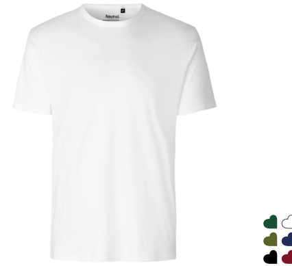
O61030 MENS INTERLOCK T-SHIRT 100% ORGANIC FAIRTRADE COTTON 220 GSM