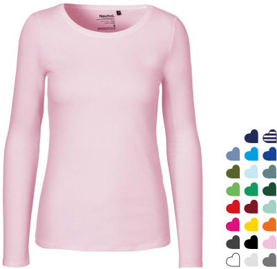
O81050 LADIES LONG SLEEVE T-SHIRT 100% ORGANIC FAIRTRADE COTTON 155 GSM