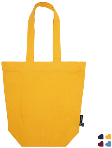
O90053 PANAMA TOTE BAG W. SIP 100% ORGANIC FAIRTRADE COTTON 300 GSM