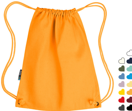
O90020 TWILL GYM BAG 100% ORGANIC FAIRTRADE COTTON 210 GSM