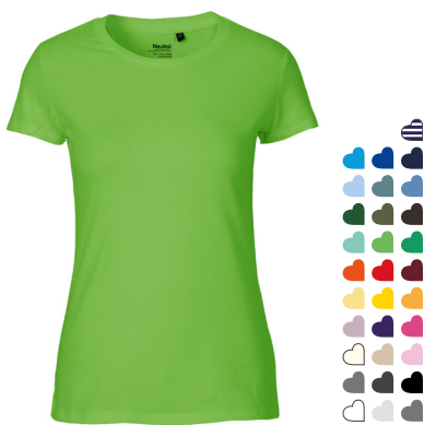
O81001 LADIES FIT T-SHIRT 100% ORGANIC FAIRTRADE COTTON 155 GSM