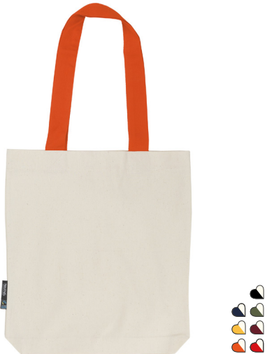
O90002 TWILL BAG W. CONTRAST HANDLES 100% ORGANIC FAIRTRADE COTTON 210 GSM