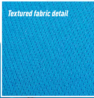
Textured fabric detail