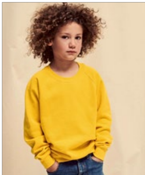
F304NK | 62-039-0 Kids' Classic Raglan Sweat

80% bomull / 20% polyester (Heather Green, Heather Navy, Heather Red, Heather Royal: 60% bomull / 40% polyester)