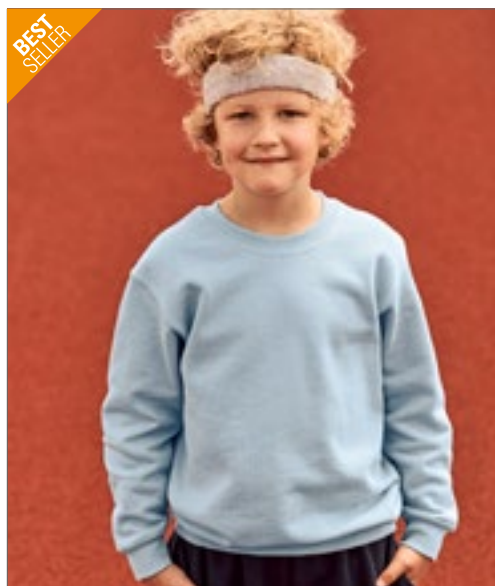
F324NK | 62-041-0 Kids' Classic Set-In Sweat

80% bomull / 20% polyester (Heather Green, Heather Navy, Heather Red, Heather Royal: 60% bomull / 40% polyester)