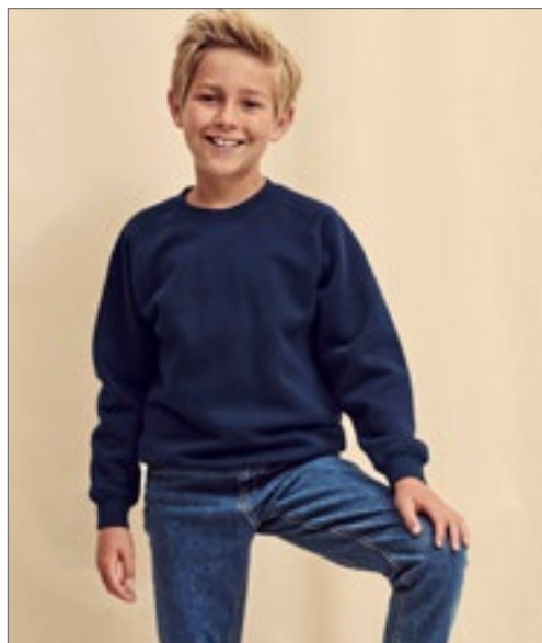
F304K | 62-033-0 Kids' Premium Raglan Sweat